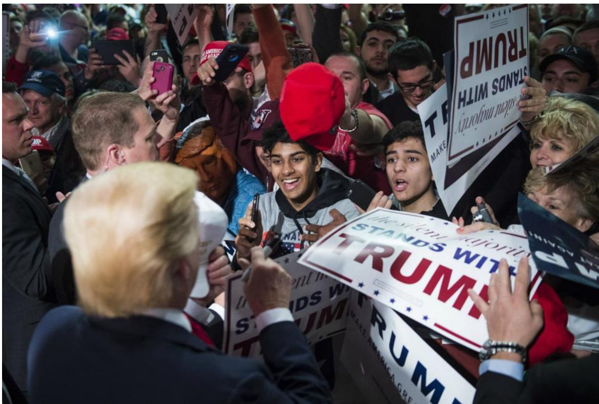
Donald Trump is expected to break the 50-percent threshold on Tuesday.

NEW YORK – It should have been a victory lap here for Hillary Clinton, who was twice elected U.S. senator from the Empire State and owns a home in Chappaqua. And it should have been the source of just a bunch of extra delegates for a Republican nominee-in-waiting, building a movement and raising money to take on the Democratic nominee in the fall.